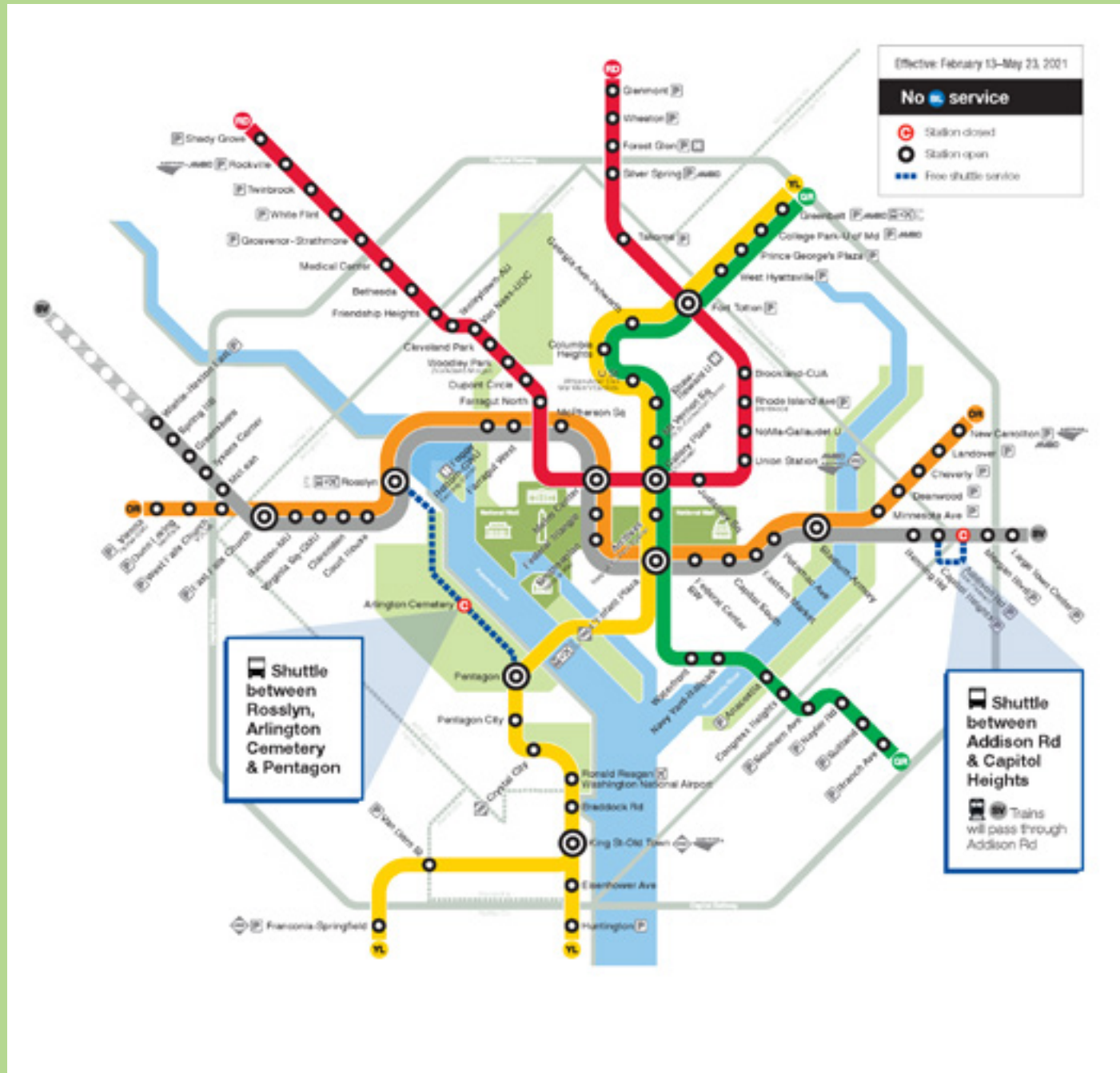
Map showing Blue Line shutdown and shuttle bus alternatives.