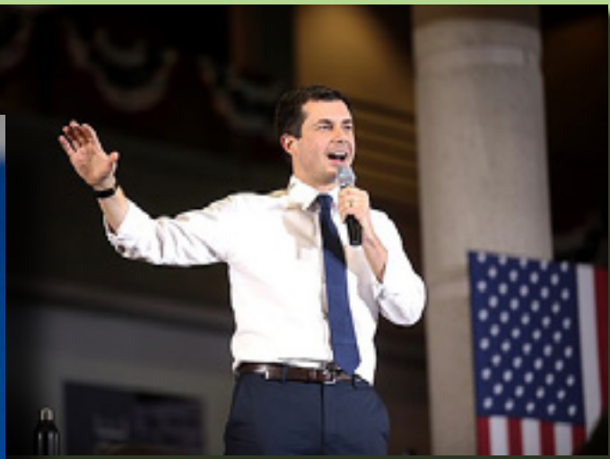
Photos: The White House via Facebook; Pete Buttigieg by Gage Skidmore, licensed under Creative Commons